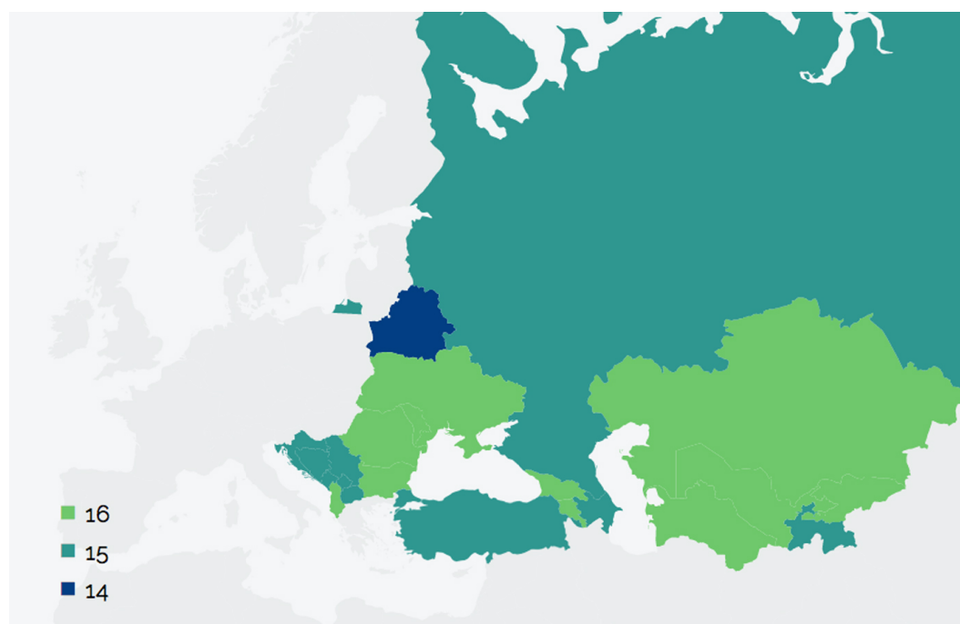
Map 8 I. Admission to Employment in CEE/CIS

Source: YPL for UNICEF. Data on Albania, Kosovo, Russia and Turkey is to be verified. The EU Agency for Fundamental Rights (FRA) has kindly provided information on Bulgaria, Croatia, Romania collected by their interdisciplinary research network FRANET. This data is provisional.