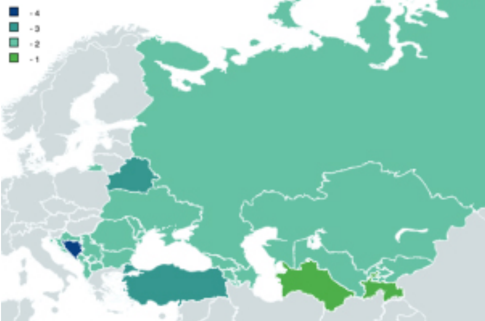
Map 5 I. Difference between general majority and earlier emancipation

Data on Albania, Kosovo, Russia and Turkey is to be verified. The EU Agency for Fundamental Rights (FRA) has kindly provided information on Bulgaria, Croatia, Romania collected by their interdisciplinary research network FRANET. This data is provisional.