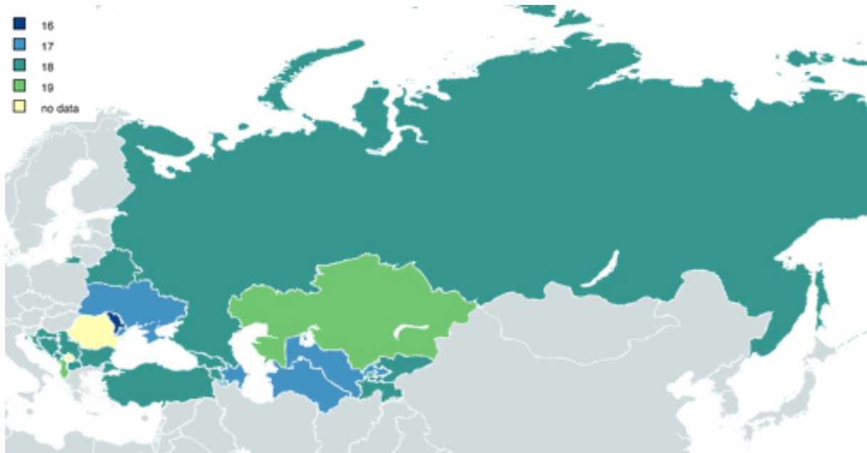
Map 10 I. Age at which children can join the military voluntarily

Source: YPL for UNICEF. Data on Albania, Kosovo, Russia and Turkey is to be verified. The EU Agency for Fundamental Rights (FRA) has kindly provided information on Bulgaria, Croatia, Romania collected by their interdisciplinary research network FRANET. This data is provisional.