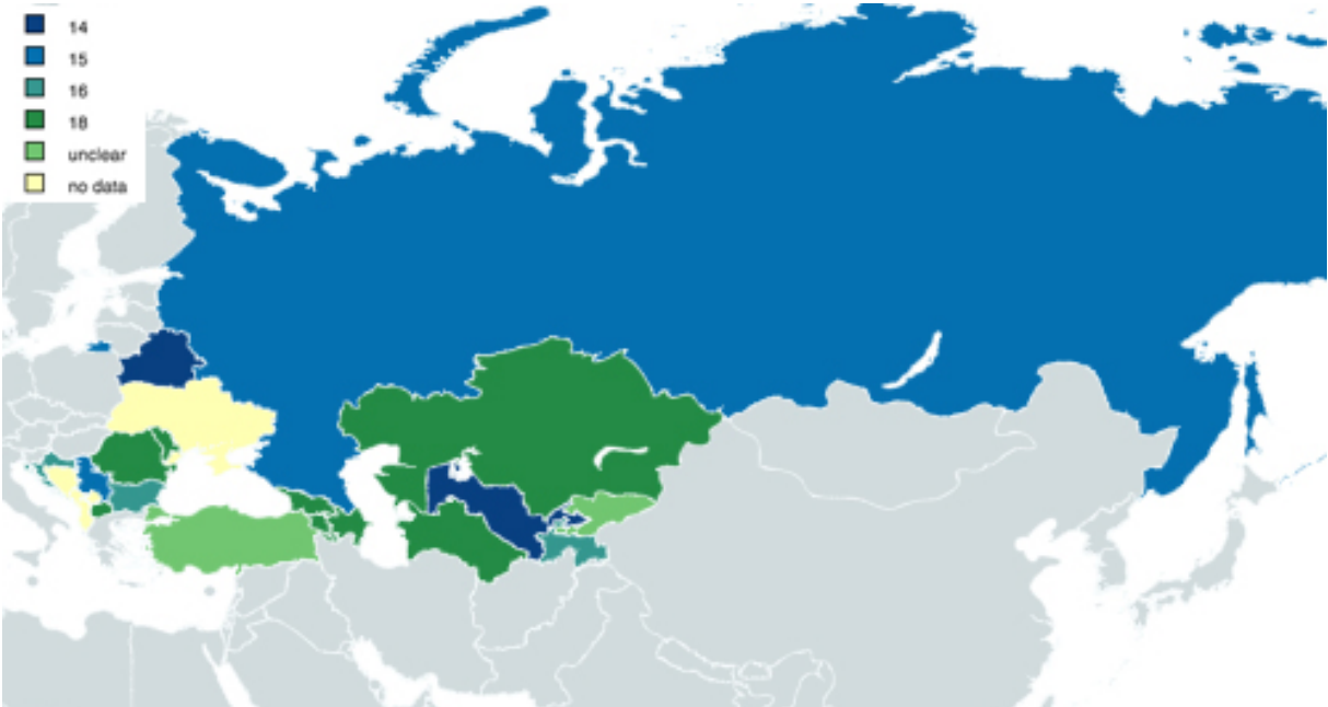
Map 9 I. Access to medical advice

Source: YPL for UNICEF. Data on Albania, Kosovo, Russia and Turkey is to be verified. The EU Agency for Fundamental Rights (FRA) has kindly provided information on Bulgaria, Croatia, Romania collected by their interdisciplinary research network FRANET. This data is provisional.