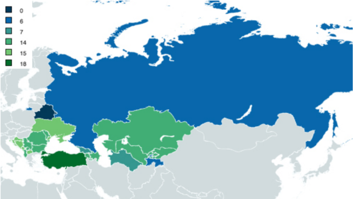
Map 8 II. The right to make small economic transactions

Data on Albania, Kosovo, Russia and Turkey is to be verified. The EU Agency for Fundamental Rights (FRA) has kindly provided information on Bulgaria, Croatia, Romania collected by their interdisciplinary research network FRANET. This data is provisional.