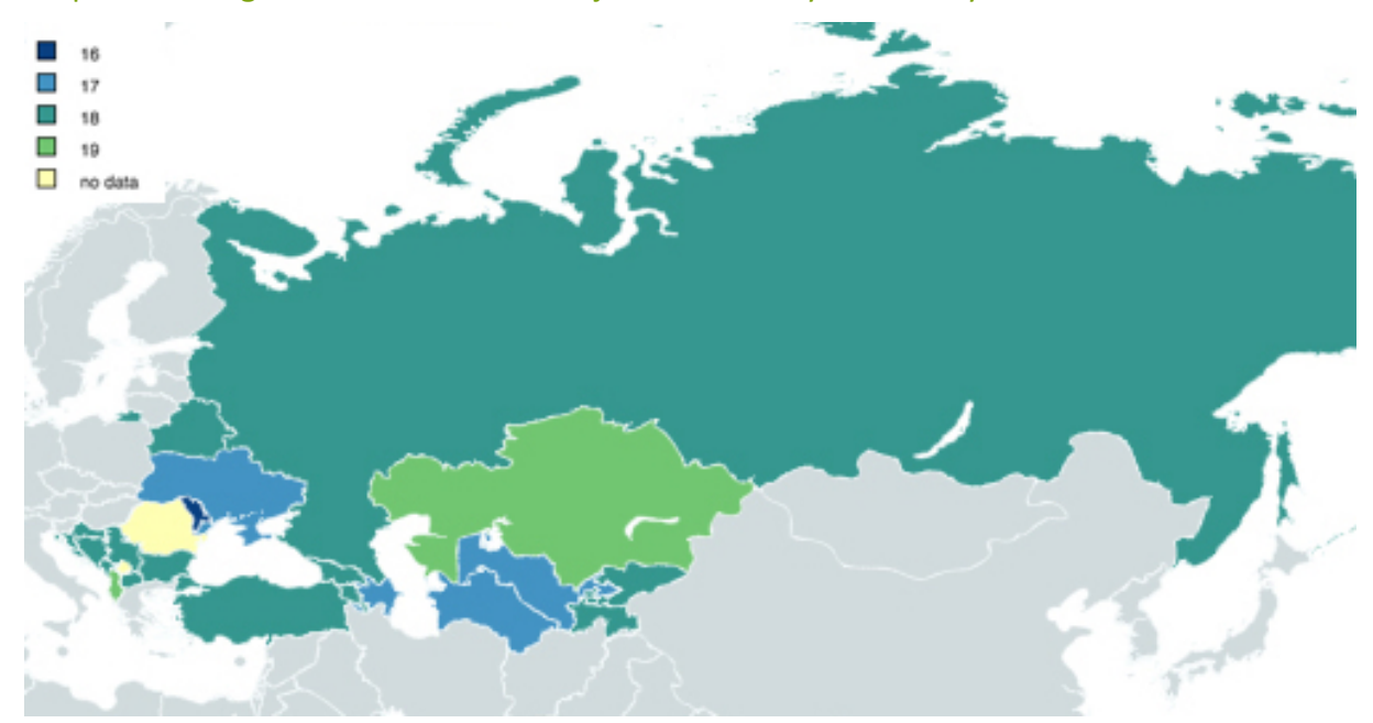
Map 10 I. Age at which children can join the military voluntarily

Source: YPL for UNICEF. Data on Albania, Kosovo, Russia and Turkey is to be verified. The EU Agency for Fundamental Rights (FRA) has kindly provided information on Bulgaria, Croatia, Romania collected by their interdisciplinary research network FRANET. This data is provisional.