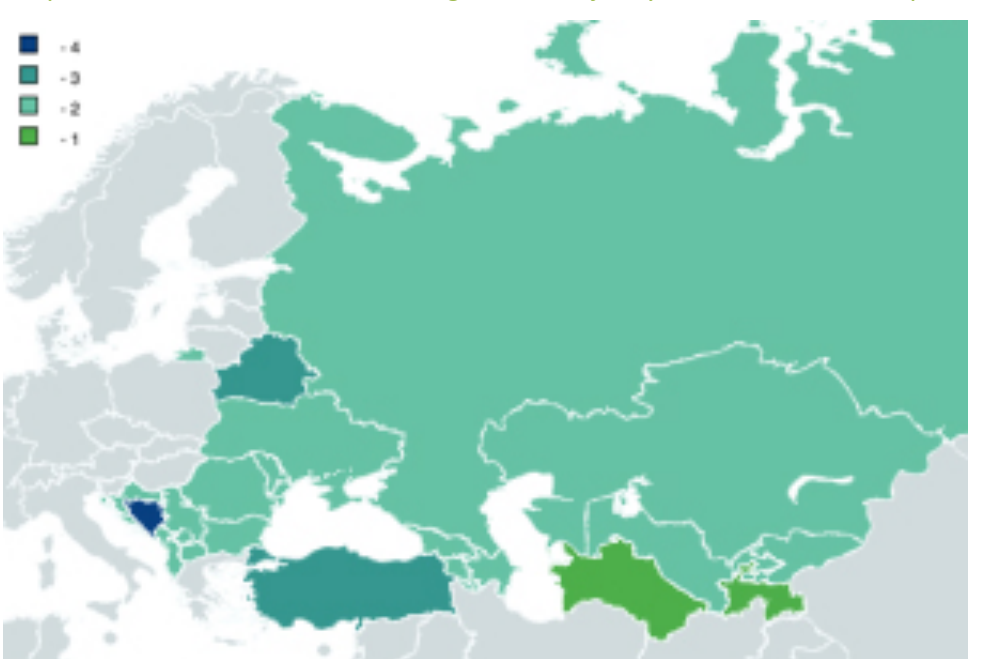
Map 5 I. Difference between general majority and earlier emancipation

The map below shows the number of years by which emancipation can be achieved prior to general majority at the age of 18, either through marriage or employment.