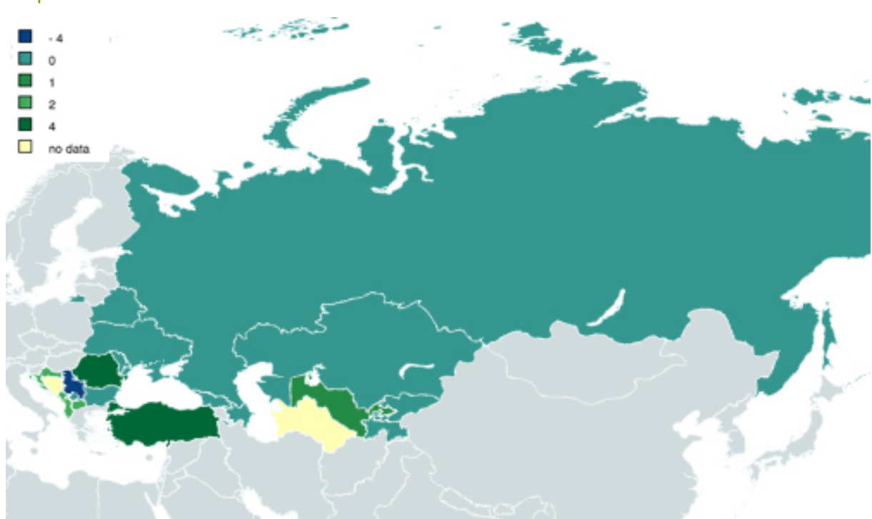
Map 5 II. Difference between MACR and MA to seek redress in court

Also interesting in this regard is that the age at which children may independently address a court, not as a defendant but as plaintiff, is not always set at the same age. The difference can be seen in the map below.