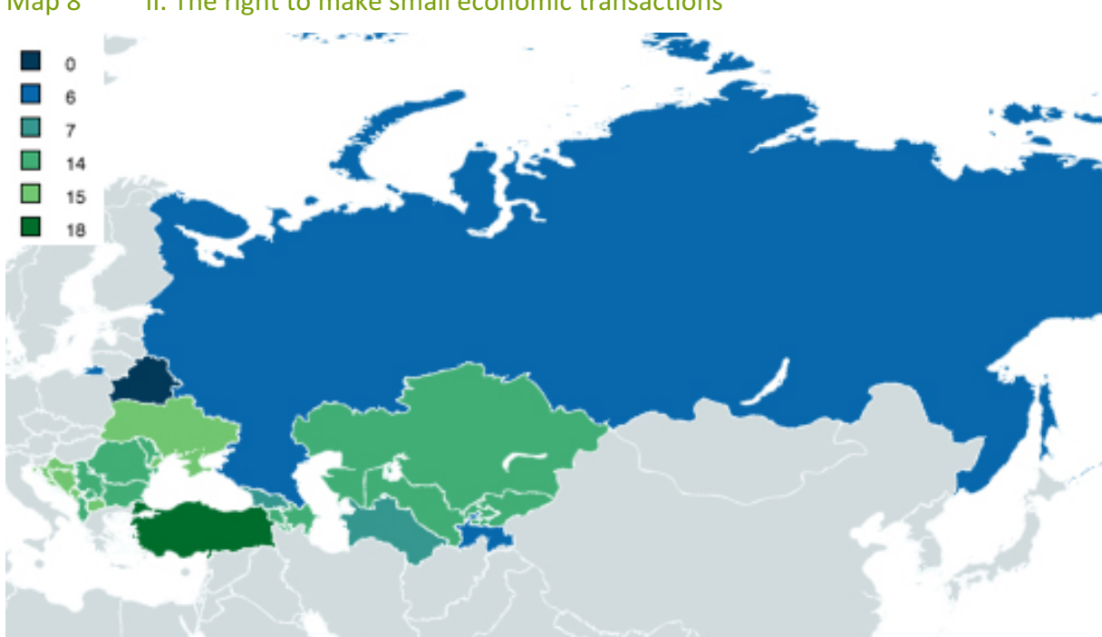
Map 8 II. The right to make small economic transactions

The research on economic rights also showed that children can often make independent decisions over own income, savings and petty dealings before the age of 18. The most frequently set age barrier in this regard is 14 years (see map below).